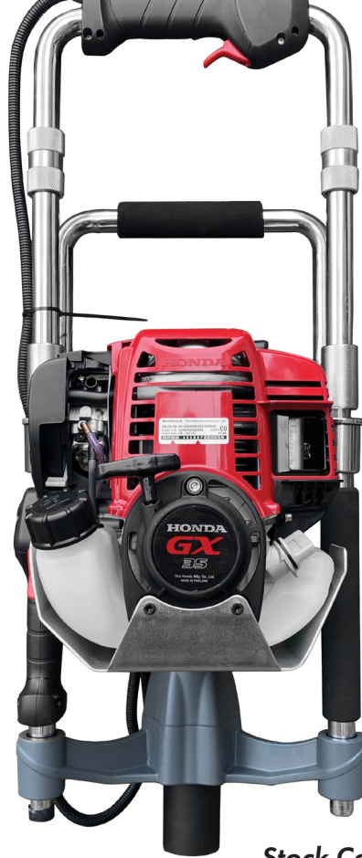
Stock Code: SD25

The Stake Driver has been tested for a vibration value of 3.26 Ai(8).