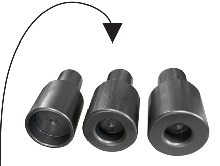
These shims can be inserted and held into place via a simple screw in system. Ensure even distribution and longevity of stakes.

The hard wearing titanium drive Shim comes with 3 different sizes: 20mm, 25mm and 41mm diameter.