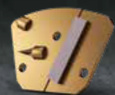
GOLD Polycrystalline diamond (PCD) for the removal of flexible materials