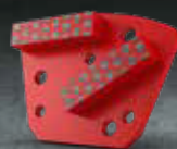
RED Soft bond segments for hard floors