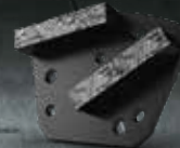
BLACK Universal bond segments for very hard floors