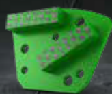
GREEN Medium bond segments for universal floors