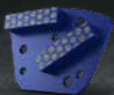
BLUE Hard bond segments for soft floors

Each wing has 2 segments with a specific "dot" design: each segment is covered with little dots which attack the floor first, thus letting the diamond open much faster for optimized grinding efficiency. DIAMAG wings are delivered in sets of 9 pieces: 3 wings for each of the 3 planetary heads .