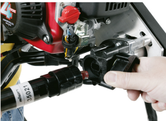
This unit makes changing heads and shafts easy via our quick disconnect system.

Scan this QR code to learn more details about this product.